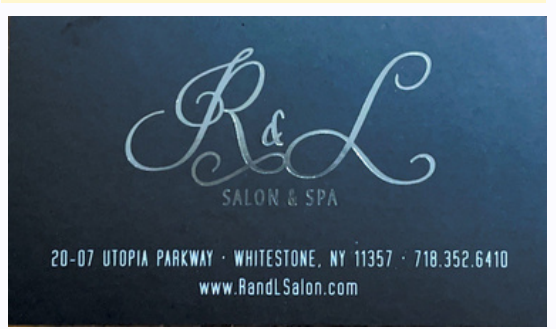
10% off Color Service, Mention WLW

Text or Call 718-767-7868 Fax 718-767-5600