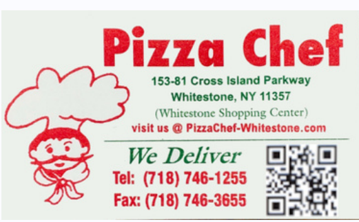
*$3.00 off your order of $18 or more